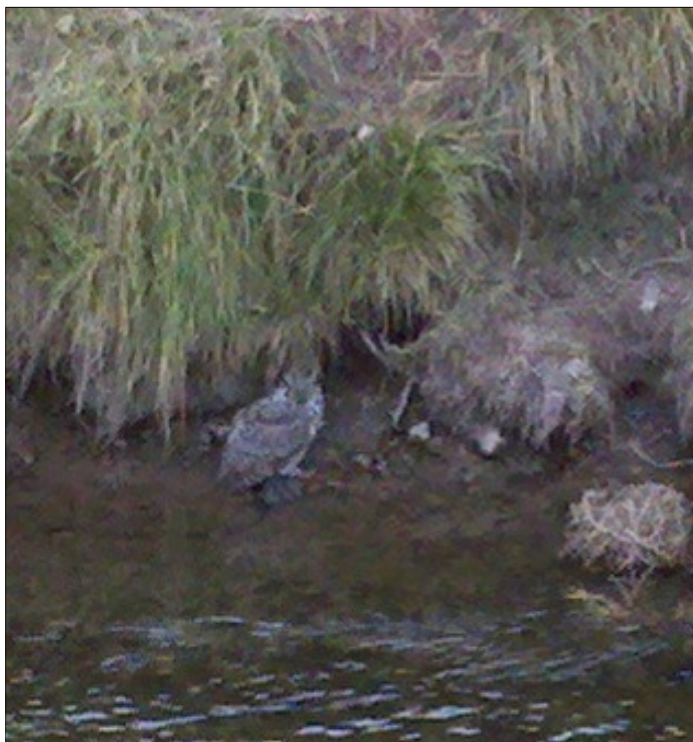
photo that she had taken at the Bosque just the week before. She and her riding partners watched a great horned owl swoop down (in the middle of the day) and catch a muskrat from the ditch. She says they watched in amazement as the owl then held the muskrat under water until it drowned. The owl then proceeded to have a leisurely lunch on the ditch bank. The picture looked better on her

phone, but here's a copy of it here. You can see the owl well, but you may not be able to make out the muskrat in its claws.